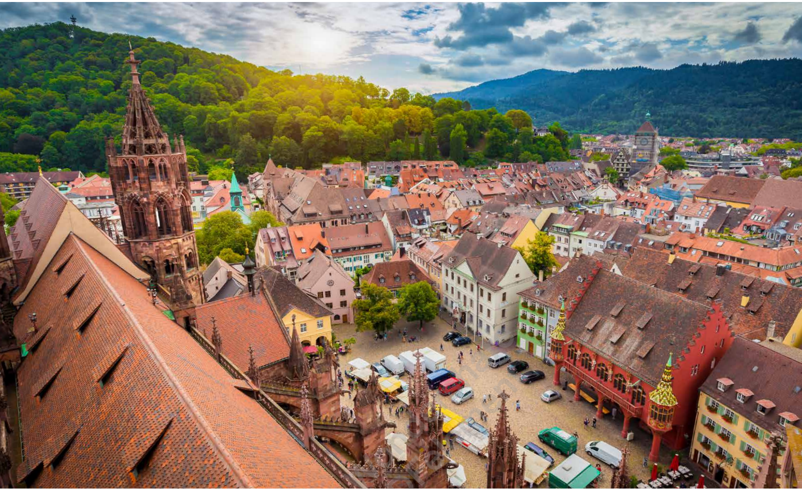
Freiburg, Black Forest Region

“I was not only completely satisfied by the experience, I was overwhelmed by it.”